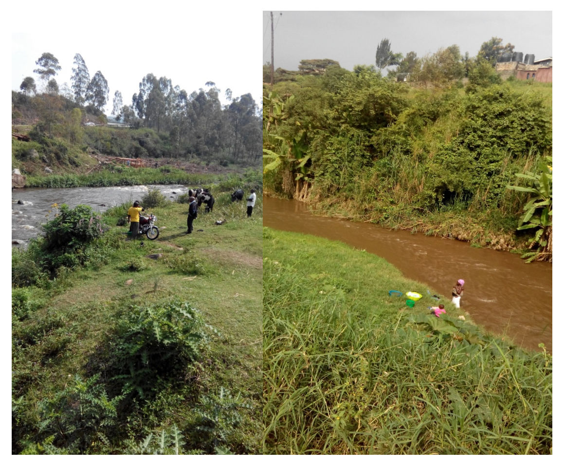
Figure 11 Field team talking to the community members on human threats to water at R.Ntungwa and R.L'hubiriha