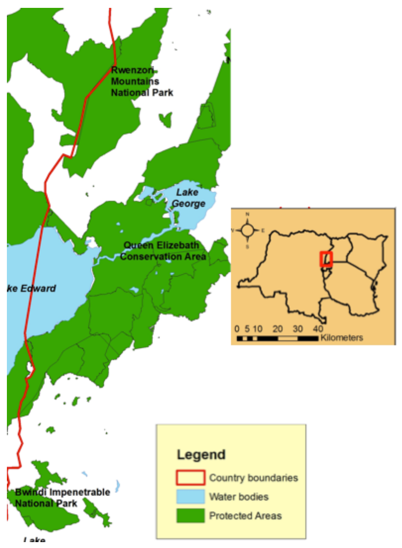
Figure 1 General Locational map of the study area in lake Edward Basin

We interviewed 30 key informants from the districts of Kasese, Mitooma, Rukungiri, Sheema and Rubirizi (Ref. Appendix). Eleven (11) Focus Group Discussions were conducted in Kyarumba, Nyakatonzi, Mpondwe and Karambi in Kasese district between June 16 and June 18, 2015. The study team conducted other Focus Group Discussions in Bitereko in Mitooma district on June 19, 2015; Bwambara and Rwenshama in Rukungiri district on June 20, 2015. Other Focus Group discussions were conducted between June 21 and 24, 2015 in Nkongoro Nyabihoko-Ntungamo, Kitagata-Sheema district, Kisenyi and Karinzu in Rubirizi district (Ref. Appendix). In total 110 people participated in Focus Group Discussions.