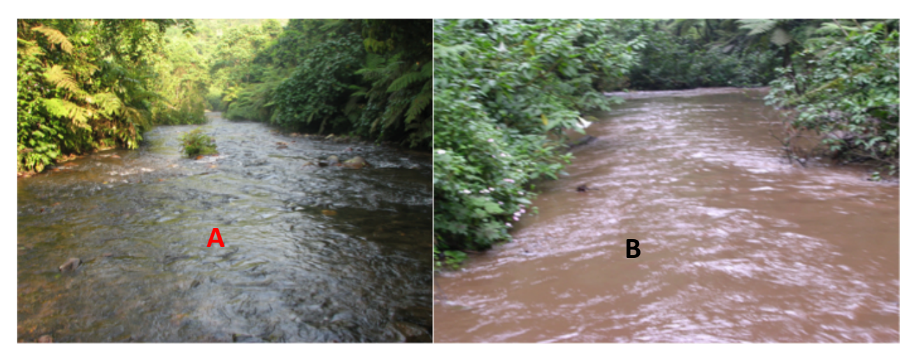
Figure 6 River Ivi in Bwindi with good water quality (A), B is the same river flowing through agricultural fields with poor water quality

The physicochemical characteristics and aquatic biodiversity of major streams and rivers of Bwindi Impenetrable National park have been studied extensively (e.g. Kasangaki et al 2006, Kasangaki 2007, Kasangaki et al 2008). For example the physicochemical characteristics and benthic macroinvertebrates of rivers Munyaga, Ihihizo, and Ishasha were investigated over a ten-year period and the data is available at the Institute of Tropical Forest Conservation archives. Over 18 species of fish have been described from Bwindi rivers including those endemic to the Albertine Rift region and some that may be