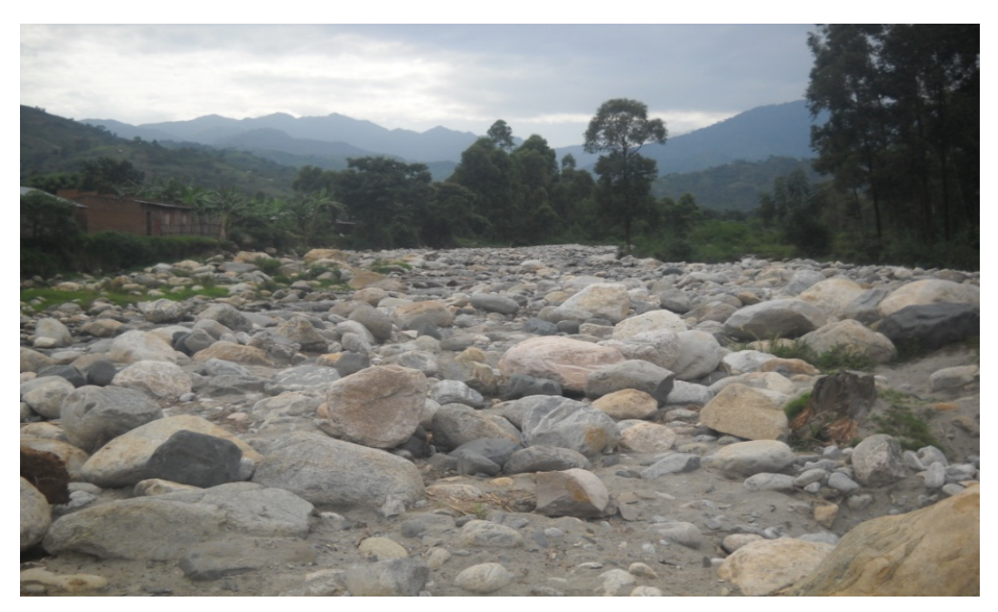
Figure 9 Boulder deposition by the recent floods in Nyamugasani river