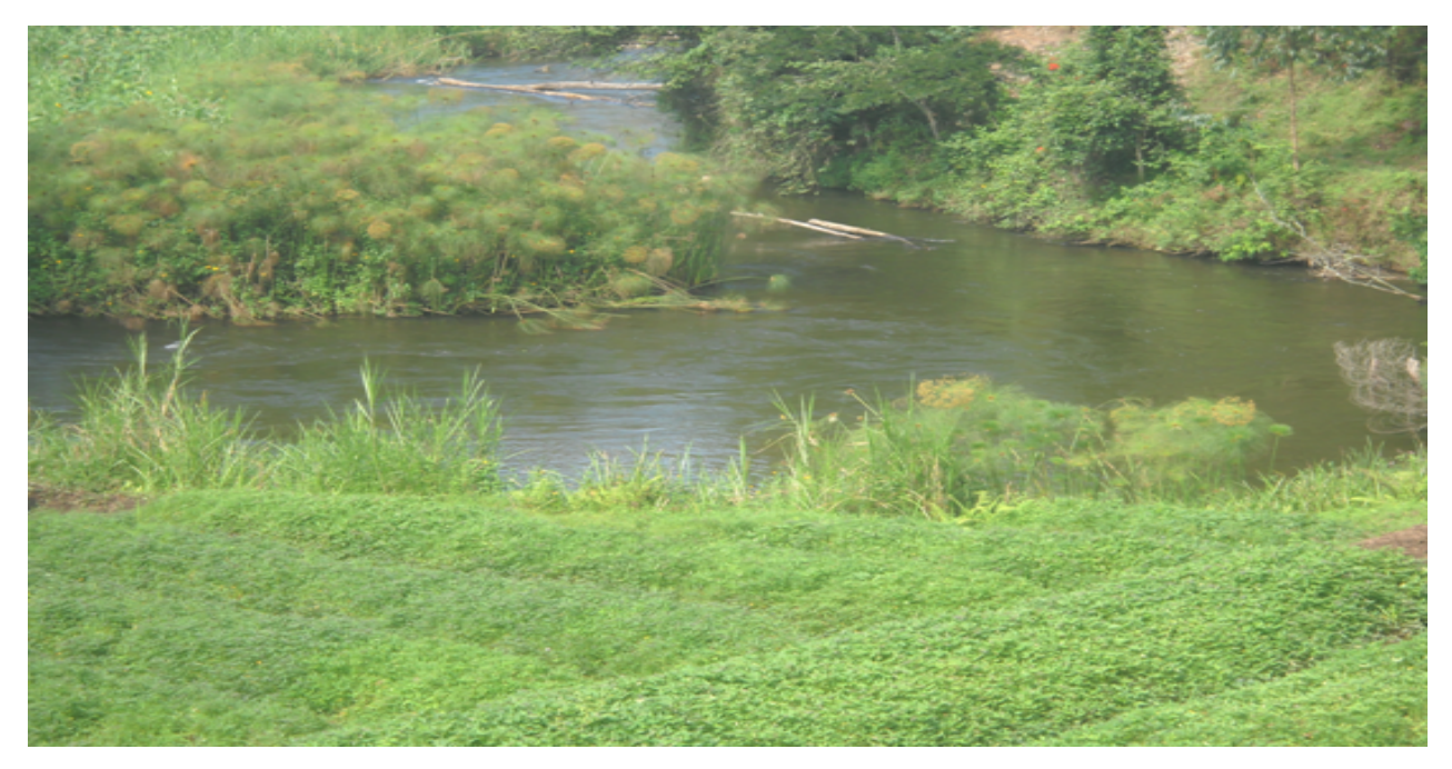
Figure 5 River Kaku as it flows through Busanza in Kisoro district, several HEP projects have been planned to be constructed on this river