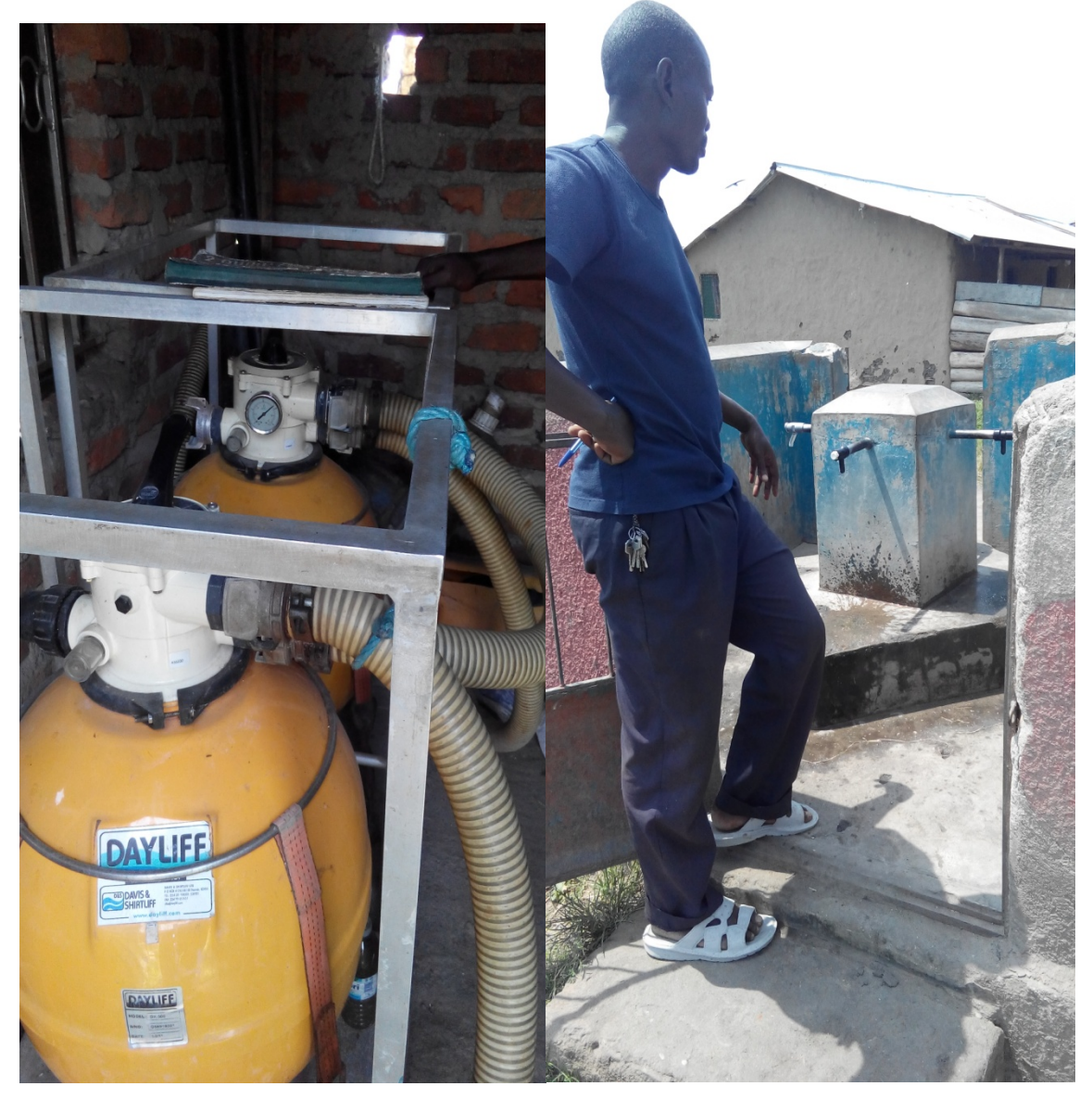
Figure 12 Gravity water management at River Newera, Rwenshama fishing village

were reviewed pronounced little on natural resource systems and management. This has resulted into ineffective natural resource management in all offices visited. In all the 5 districts, Kasese was fairly active compared to other districts.