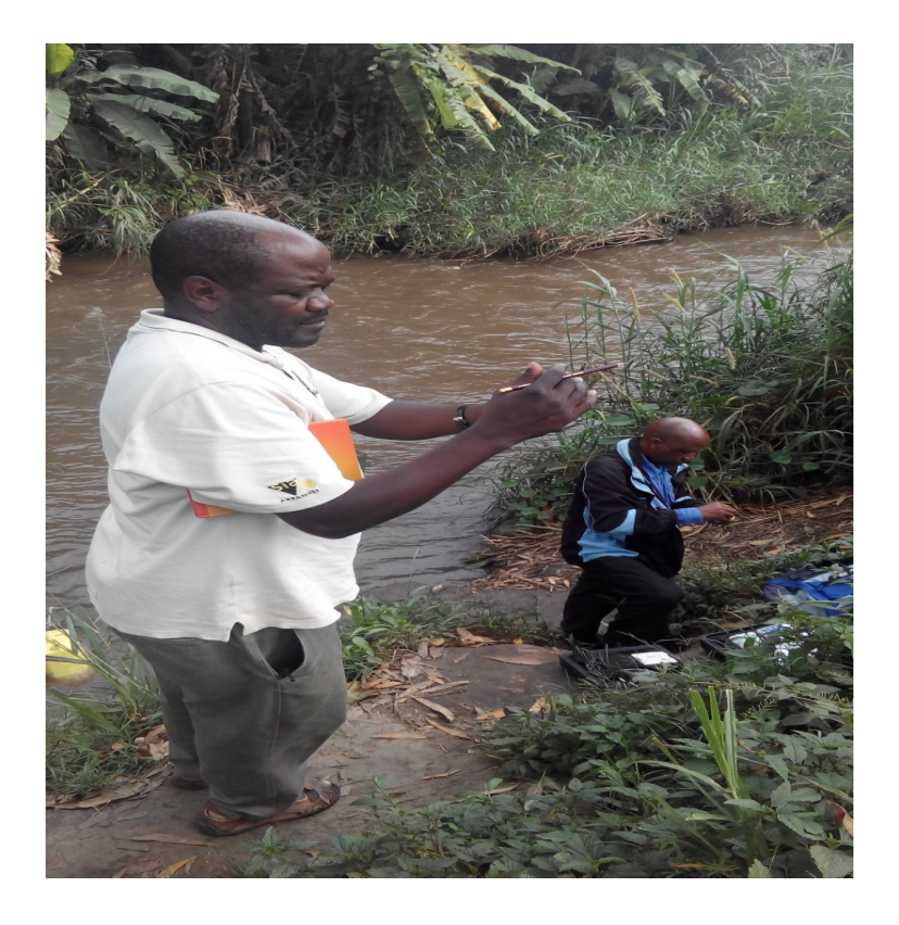
Figure 3 An Assessment of the hydrological condition of River Ishasha-Uganda

A watershed approach was employed to assess the hydrological conditions of the major rivers flowing into the Lake Edward. The major rivers and their watershed were identified and assessed using an integrated landscape assessment that involved scanning the landscape for any signs of degradation in addition to visiting the rivers to assess the