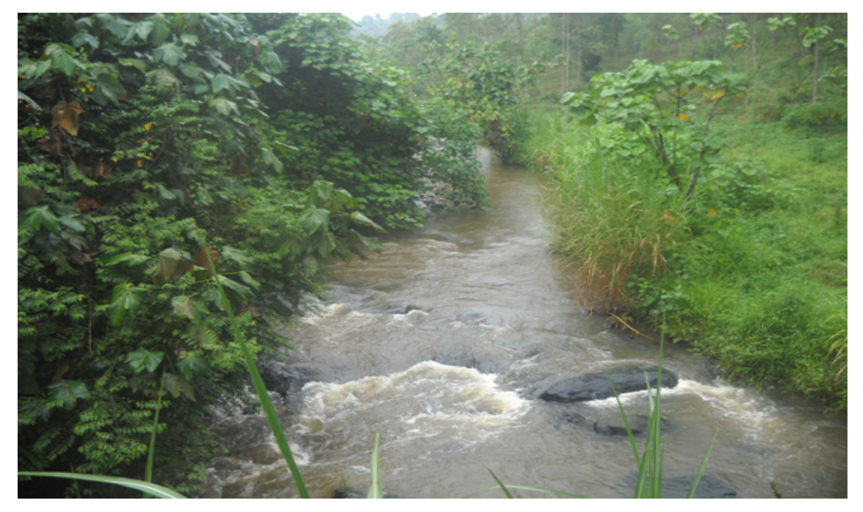
Figure 10 River Newera with slightly turbid water in the upper catchment area

River Newera is a medium sized river (Plate 7) whose source is in Mitooma district (Bushenyi previously) from an urban wetland at about 1500m altitude. The upper catchment of Newera is relatively well vegetated and thus its water quality/clarity appears natural. However, the river gets progressively turbid as it flows downstream and by the time in enters QENP, the river is heavily laden with sediment and the colour of water is brown. The degradation downstream may be mostly from agricultural runoff. Downstream the river is an important water source for wildlife such as buffaloes that are often sighted wallowing in the river. The river often breaks its banks leading to damage of the bridge along the Katunguru-Ishasha road. Sediment carried downstream may be impacting the aquatic biota within the stream and the Lake Edward ecology.