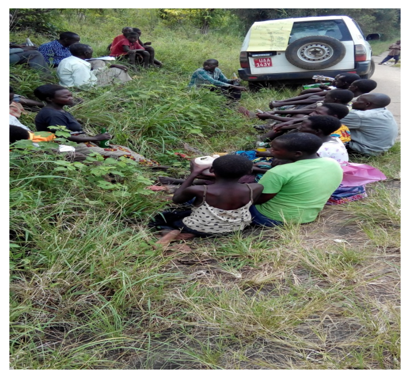
Figure 4 Focus Group Discussions in Bwambara, Kasese District

Data was collected through Focus Group Discussions and Key informant interviews (plate 2). A total of 11 FGDs were conducted and each FGD was composed of 10 participants. In total 110 people participated in FGDs. FGDs helped to generate detailed data on historical changes, water demand, supply, perceptions on water quality and potential threats. Thirty (30) key informants were interviewed and these included; district local government staff (natural resource and environmental officers, population officers and planning staff (n=08), local leaders (n=18) and National Park staff (n=04). The integration of key Informants aimed at identifying policy related and administrative measures put in place for water resource management. They also helped share data on natural resource plans and strategies of reversing existing degradation.