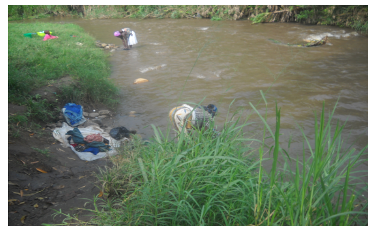
Figure 7 Water use of river L'hubiriha at the Uganda-DRC border. Note therurbid water from activities upstream

Human activities along the river such as cultivation and washing clothes may be impacting the water quality and aquatic biodiversity of the river (Plate 5). Further downstream before the river enters Queen Elizabeth National Park, the river flows near the Bwera-Mpondwe border town where is heavily polluted by urban activities such as motor vehicle washing, open urination and defecation. Being a transboundary river, management of the water resource in the river may be challenging, as it will require the consultation of authorities in both DRC and Uganda. On the Ugandan side of the river, the upstream part of the river is already harnessed for a gravity flow scheme and there are plans for the expansion of the system according the Kasese District Natural Resources Officer, Mr Joseph Katswera. There is there're an urgent need for a harmonized approach to the exploitation of the water resources within the river to avoid over-exploitation and to curb the rampant pollution especially from urbanization.