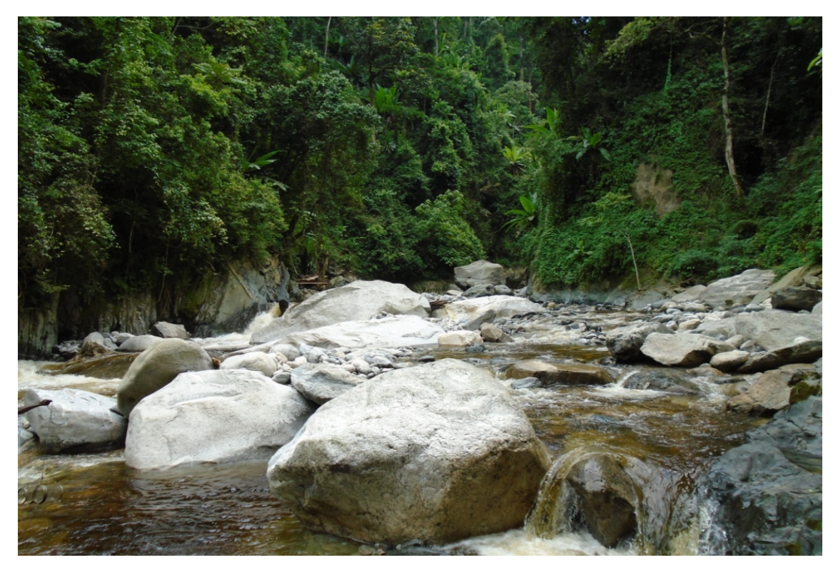
Figure 8 Nyamugasani river, the proposed location of a weir for the HEP plant. Note the pristine nature of the river upstream compared to the flood prone downstream areas (figure 9 below)